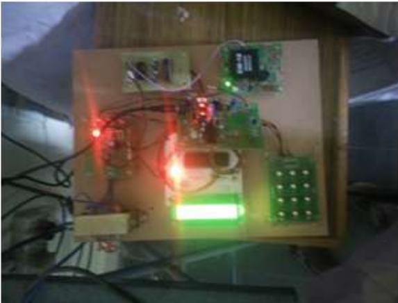
Figure2: Prototpe model of system

event that the client needs to get any apportion material, the client needs to demonstrate the proportion RFID label card to the RFID per user, the per user will perceive the RFID numbers appear by the client. Every client will have a novel number, which is not noticeable to the client. This perceived RFID number will be given to a microcontroller, which contrasted the info number and the database. Before beginning the framework, the exceptional RFID number of the apportion client will be customized in the controller, for example, User name and secret key, so that the controller will perceive the information originating from RFID by contrasting and the database. Once the client is distinguished, the apportion things to be administered will be shown on the LCD screen, the client needs to bolster the remarks, for example, the weight he will purchase. As the apportioning procedure is going on all the while the controller will send a charge to GSM Modem, to send the content SMS to the client about the proportion thing, he or she obtained.